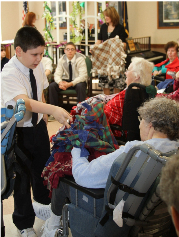
Presenting the blankets that we made in our “houses” to residents of the VA nursing home...